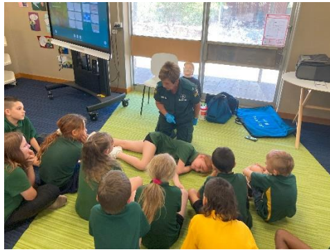
Learning basic CPR.