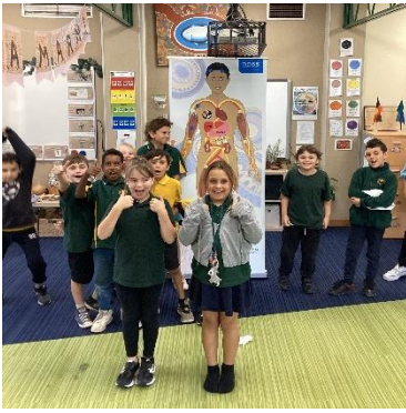
Dietician teaching us about the effects of diabetes.