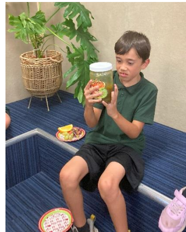
Looking at the effects of smoking and vaping on our bodies.