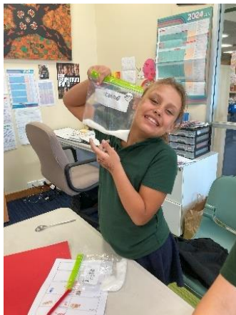
Measuring how much sugar is in our snacks.

This year our Aboriginal students have been busy participating in the Young Doctors health and wellbeing program. Over the 15 weeks some of our highlights were learning about sugar content in our lunch box's, Aboriginal tool making, learning about diabetes, smoking and vaping, first aid and managing our emotions.