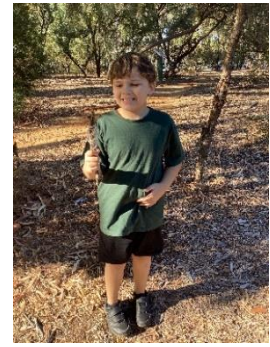
Making a hammer from natural resources in the Kaurna Garden